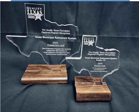
Quality Texas Foundation Engagement and Pioneer Level Awards

Congratulations to our entire organization for the exceptional efforts improving quality for the benefit of our 220,000 Members, retirees and beneficiaries! ★